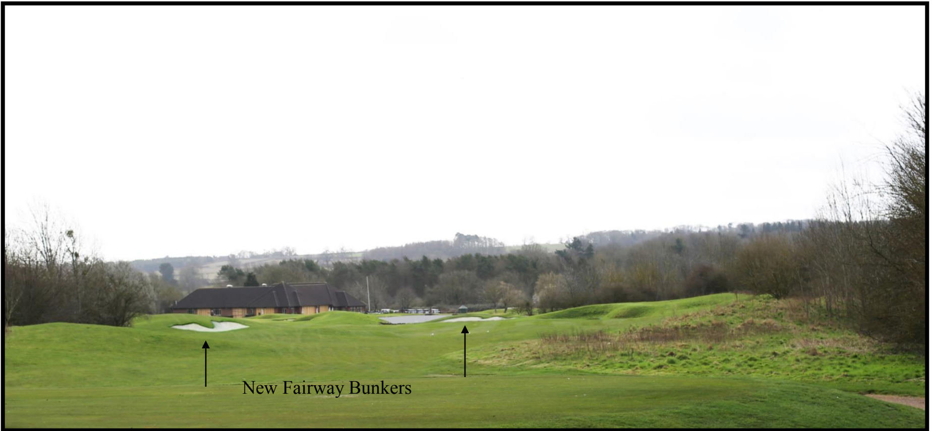
New Fairway Bunkers