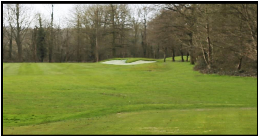
8 th Tee Shot –Proposed New Bunker on the right of the Dogleg.