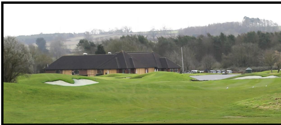
18 th Hole Proposed Fairway Bunkers