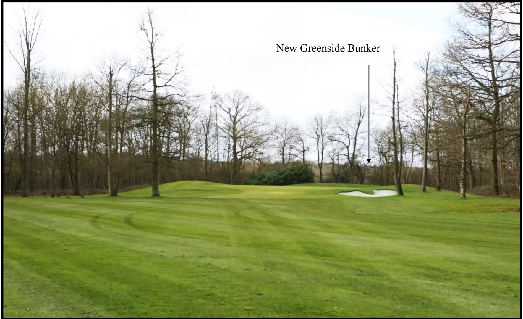
8 th Hole Approach Shot – Proposed New Bunker on Right Front of Green